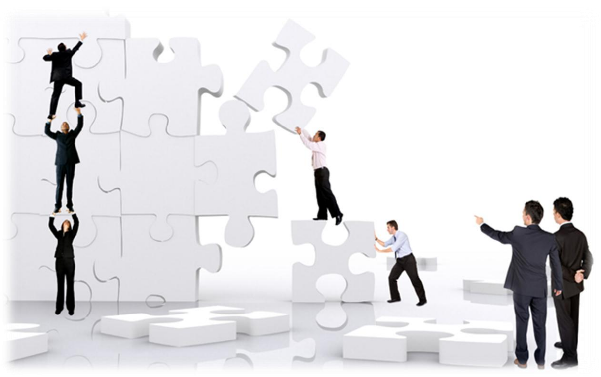
More Intelligence Solutions